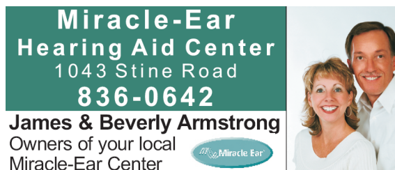
Full Color Sample